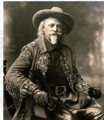
Bro. Buffalo Bill Cody

A member of Platte Valley Lodge No. 32 in North Platte, Nebraska